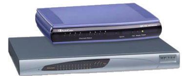
AudioCodes MP 114/118